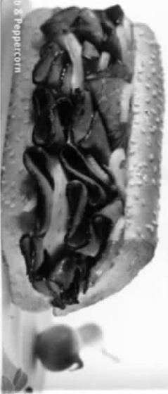
Prime Rib & Peppercorn