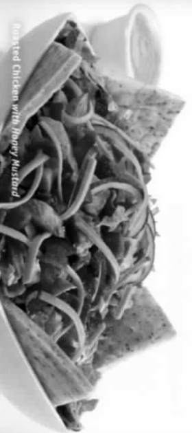
Roasted Chicken with Honey Mustard

Chopped Side Salad Tomatoes, red onion and your choice of dressing: Raspberry Chipotle, Honey Mustard, Peppercorn Caesar, and fat-free Balsamic Vinaigrette