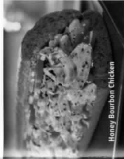
Honey Bourbon chicken